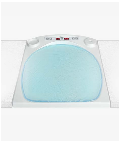
Under-pad heating device, table-top module THERMOCARE Convenience