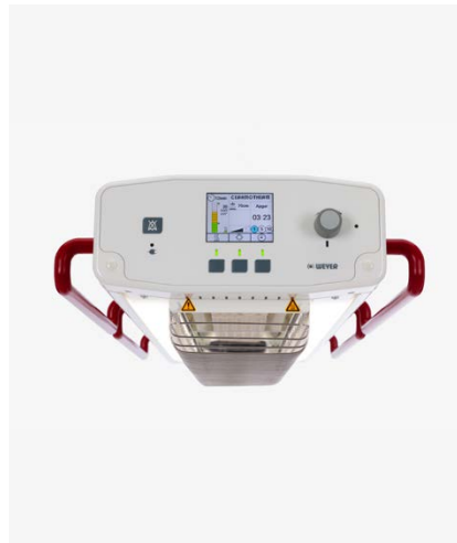
Radiant warmer CERAMOTHERM®