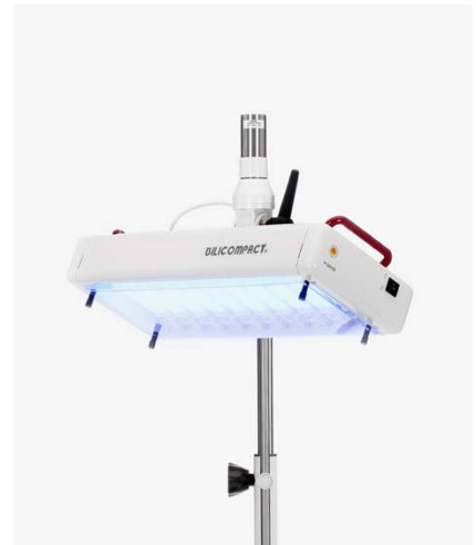
Phototherapy device BILICOMPACT®