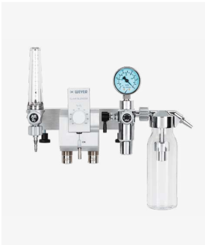
Insufflation and suction REANIMAT®-O2-Blend

WEYER devices build a unique product line, the components and elements of which are compatible. Amongst others these are: