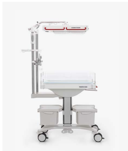
Open intensive care VARIO THERM®