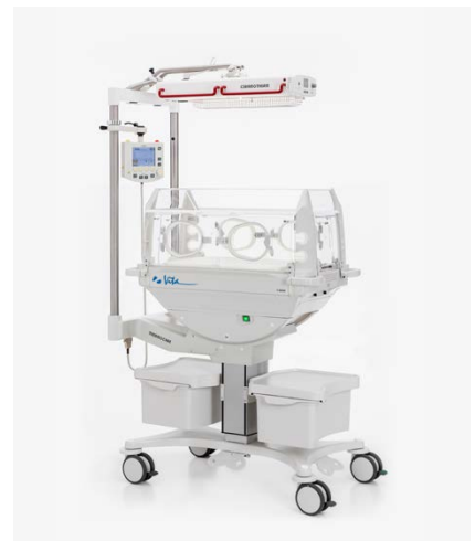
Incubator THERMOCARE Vita